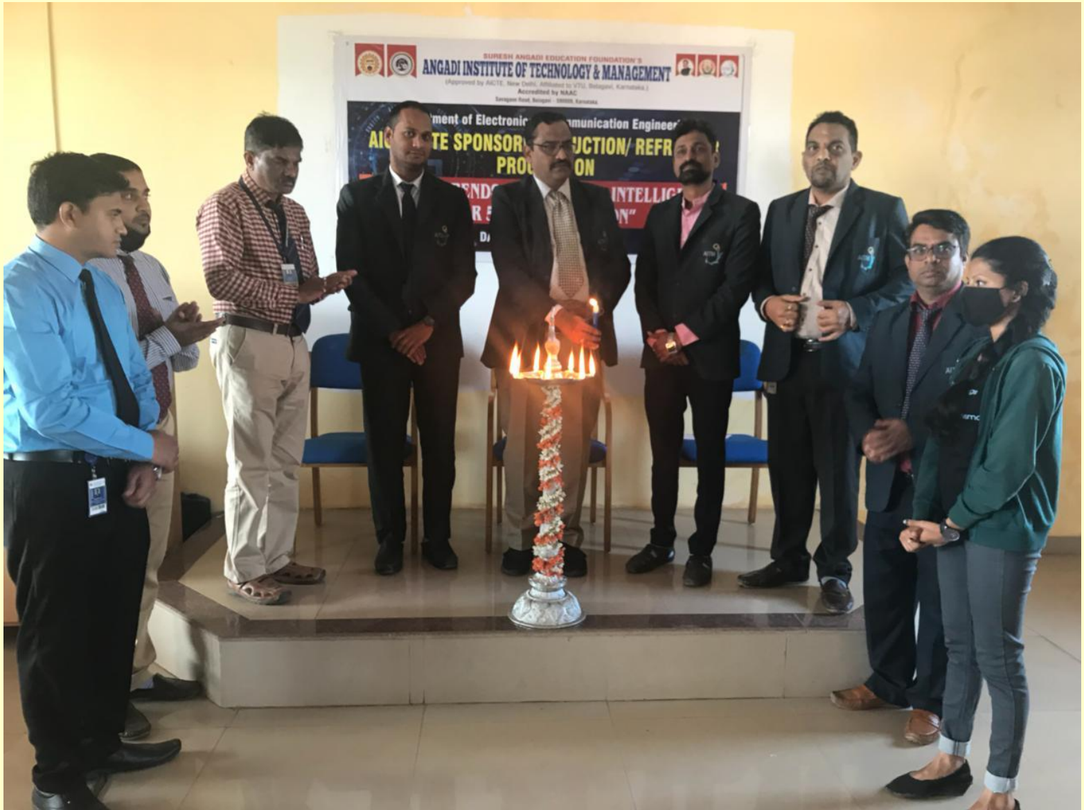
Inauguration of the ISTE workshop